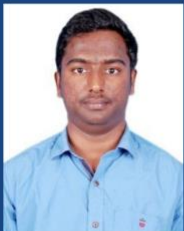
GUGHAN VS SRE COIMBATORE AIR 142 (AE)