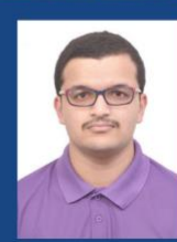
U SUHAS BMS BANGALORE GATE SCORE-596 (ME)