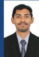
A GANADEV SHASHANKA ALLIANCE BANGALORE AIR 58 (AE)